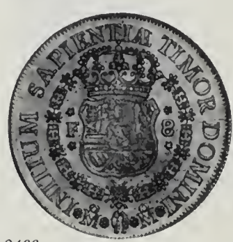
Lot No. 2466

Philip V, 1700-1746. 8 Escudos, 1733 Mo-F. Obv. Peruked and armored bust. Rv. Crowned Arms within the Collar of the Golden Fleece, surrounded by INITIUM SAPIENTIAE TIMOR DOMINI. C-T 162, KM 148, Fr.8. From the wreck of the 1733 Fleet and accompanied by a certificate of authenticity. A superb coin, Virtually As Struck. Rare. (SEE COLOR PLATE)